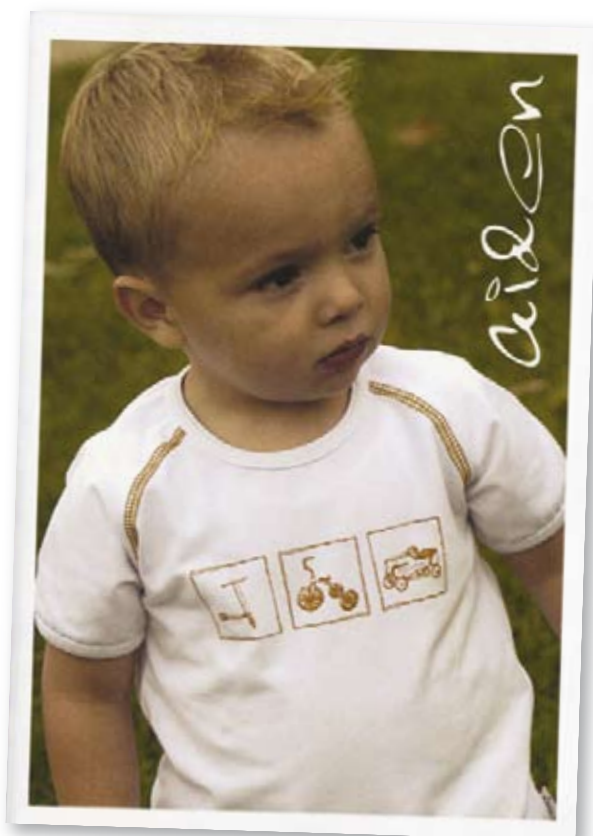
AIDEN-CHILDREN'S VINTAGE PRINTED T-SHIRT

To has also worked with many specialty brands and independent labels, with Fila Sportswear being the most famous.